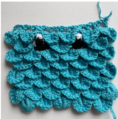
Row 18: As row 2